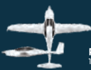
PANTHERA 540 10.9m (358")

All Pipistrel products are designed and manufactured in our 100% eco-friendly facility and follow our ECOLution concept.