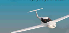
EU Project Hypstair 200kW serial hybrid electric powertrain for general aviation