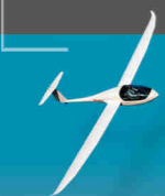
Taurus Electro world's first two seat electric aircraft

2007 2009 2008 2010 2011 2012 2013 2014 2015 2016