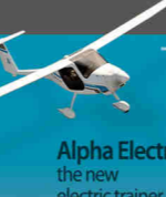
Alpha Electro the new electric trainer