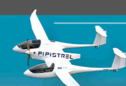
Taurus G4 world's first four seat electric aircraft