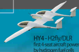
HY4-H2fly/DLR first 4-seat aircraft powered by hydrogen fuel cells