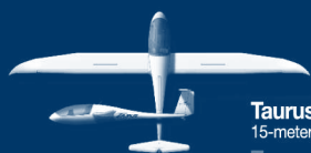
Taurus M 15-meter wingspan Taurus Electro 15-meter wingspan