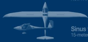
Sinus 912 15-meter wingspan