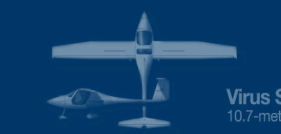
Virus SW 80/100 10,7-meter wingspan