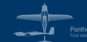
Panthera Four seat fast cruiser

needs 3 minutes, 6 minutes to 1000 m (3300 ft) and 10 minutes to 1500 m (5000 ft). Then, reaching target altitude you shut down and retract the engine at a flick of a switch - literally. It may seem unspectacular but Taurus outperforms even single-seat self launching gliders when it comes to take-off and climb!