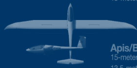
Apis/Bee 15-meter wingspan 13,5-meter New FAI class ready